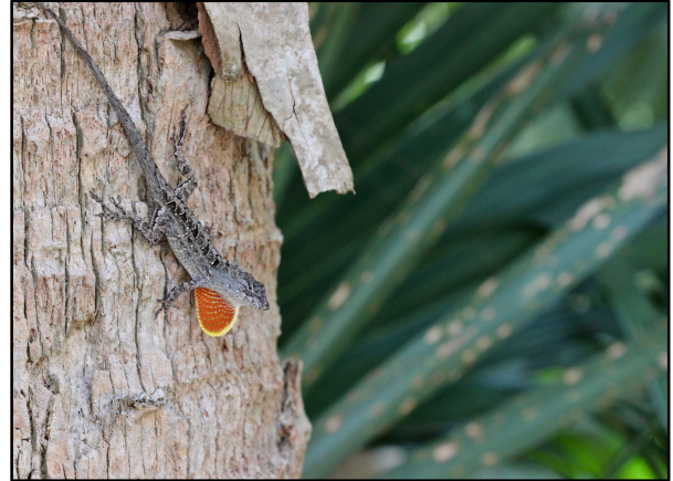
A male anole uses his bright, red dewlap to signal to other anoles.

Natural selection happens when differences in traits within a population give some individuals a better chance of surviving and reproducing than others. Traits that are beneficial are more likely to be passed on to future generations. However, sometimes a trait may be helpful in one context and harmful in another. For example, some animals communicate with other members of their species through visual displays. These signals can be used to defend territories and attract mates, which helps the animal reproduce. However, these same bright and colorful signals can draw the unwanted attention of predators.