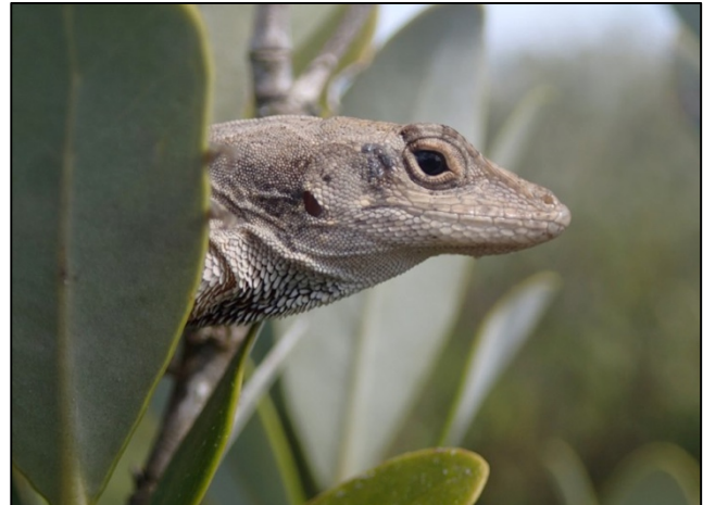
Adult brown anole ( Anolis sagrei).

When Charles Darwin talked about the “struggle for existence” he was making the observation that many individuals in the wild don’t survive long enough to reach adulthood. Many die before they have the chance to reproduce and pass on their genes to the next generation. Darwin also noted that in every species there is variation in physical traits such as size, color, and shape. Is it simply that those who survive to reproduce are lucky, or do these traits affect which individuals have a greater or lesser chance of surviving? Evolutionary biologists often work to see how differences in traits, such as body size, relate to differences in survival among individuals. When differences in traits are related to chances of survival, they are said to be under natural selection .