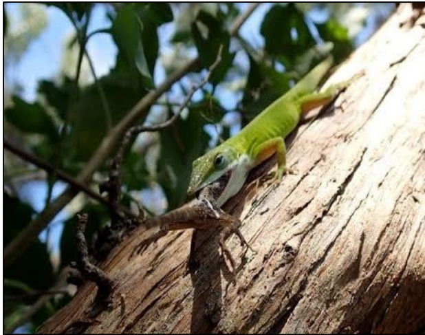
Adult green anole eating a hatchling brown anole.

To test this, Aaron and Robert captured hatchlings in July, assigned a unique identification number to each anole, measured their body length, and then released them back onto the island. In October of the same year, they returned to the island to capture and measure all surviving lizards. They calculated the average percent survival for each size category. Aaron predicted longer individuals would have higher survival. This would indicate that there was natural selection for larger body size in hatchlings.