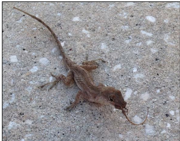
Adult brown anole eating a hatchling brown anole.

Scientific Question: How does the size of a brown anole lizard hatchling affect its chances of survival?