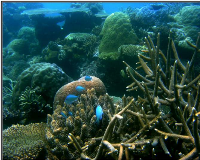
A Pacific coral reef with many corals

Carly is a scientist who wants to study coral bleaching so she can help protect corals and coral reefs. One day while out on the reef, Carly observed an interesting pattern. Corals on one part of a reef were bleaching while corals on another part of the reef stayed healthy. She wondered, why some corals and their algae can still work together when the water is warm, while others cannot?