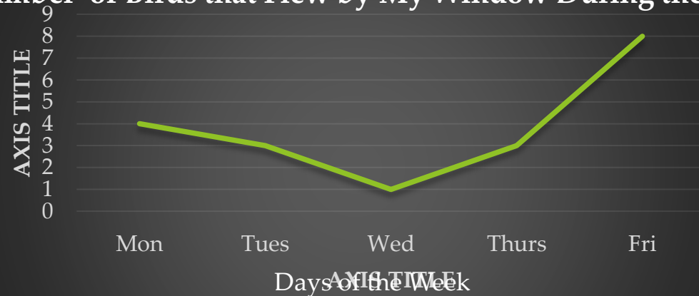
Number of Birds that Flew by My Window During the Week

Shows trends or how data changes over time.