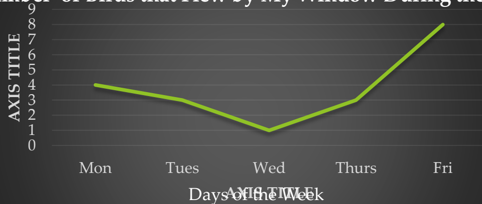
Number of Birds that Flew by My Window During the Week

Shows trends or how data changes over time.