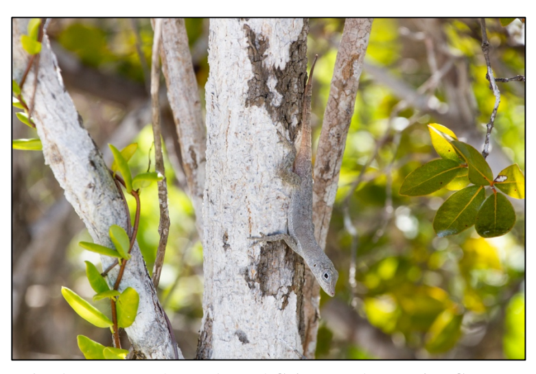
\label{eq:Anolis scriptus} \textit{Anolis scriptus}, \textit{the Turks and Caicos anole}, \textit{on Pine Cay}.